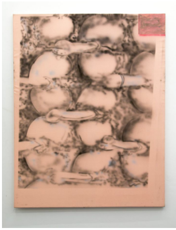
Unlimited Rationalization, Universal Enrollment...

Acrylic paint on pink velvet, 140 x 118 cm