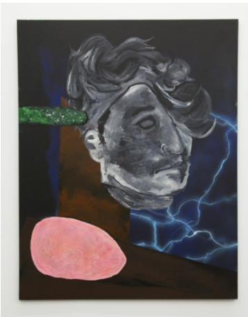
Il Canto D'Amore