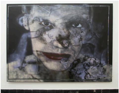
The Soul at Work

Large scale remake of L'Origine du Monde by Gustave Courbet, positioned in the exhibition as the point of origin (pun) in a sequence of transgender sculptures made after the Hans Von Marées painting Die Lebensalter (the seasons of life).