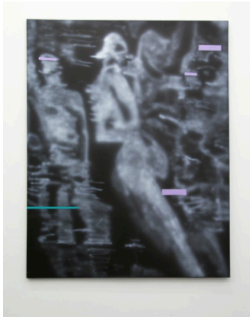
Total Sex Party