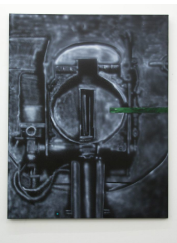
Passagen II (HR Giger)

Title and part of the composition borrowed from a 1916 work by Giorgio De Chirico. De Chirico's green ball is replaced here by a severed lamb testicle and the bust is a mash up of De Chirico's original marble figure, the hollow bronze James Dean memorial in Griffith Park, LA, and a portrait of the porn actor James Deen. The pickle is a wink to War Pickles , an all-male exhibition that took place two years ago at House of Gaga. Here as with everywhere else in this exhibition, many readings are possible.