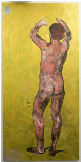
Man selling oysters

Large-scale portrait loosely based on the guy in Taylor Swift's video Style , painted with Tim Gore's line of airbrush colors "Bloodline". The overlays depict heterosexual and homosexual sodomy, an image of a couple kissing from a viagra ad on the internet and a still from a dream/nightmare sequence in the movie An American Werewolf in London , suggesting various masculine psycho-sexual and emotional states. The whole is framed by the architectural diagram of a room whose door is ajar— confinement but also, a gesture towards the outside world. The title is a joke and is borrowed from a 2011 Semiotext(e)-published Franco Bifo Berrardi book.