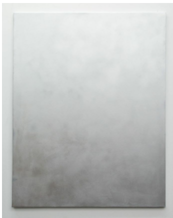
Thirteen Most Wanted Men (1 of 13)

Bad painting of miss piggy from a bad personal photograph of a painting hanging in the gay bar Roses on Oranienstrasse in Berlin.