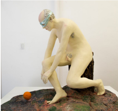
Trans Von Marées' The Seasons of Life (?) I

of them being Italian and the negative repercussions that could have had on the Italian-American part of his electorate, which has nothing to do with this exhibition. The dimensions here are not exact. Warhol's is a little bit wider and not as tall.