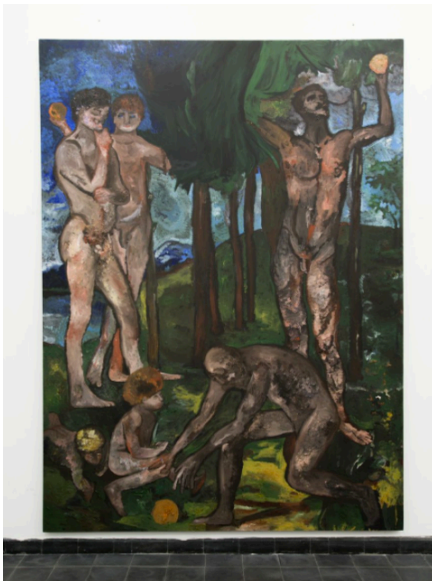
Trans Von Marées—The seasons of life